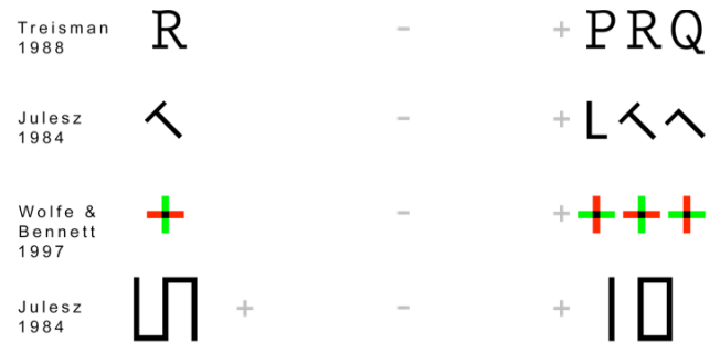
Supp. Fig. 3. Is crowded vision “preattentive”? These are minimal versions of stimuli that are known to require serial search 29, 31, 32 . In the top three rows, fixating the central minus, you will easily identify the isolated target at the left, but you will fail to identify the same now-crowded (middle) target on the right. The bottom row shows self-crowding: Fixating on the minus you will find that the left and right targets are indistinguishable. In every case, you can readily identify the target if you fixate the nearby small grey plus. Thus, reducing eccentricity changes your vision from “preattentive” to “attentive” even though you are concentrating on the target throughout.

Wolfe and Bennett 29 describe shapeless “preattentive object files” of “unbound” [not combined] features. This is similar to the “bag of features” idea in machine learning 30 , and seems to be a good description of crowding. Indeed, the “attentive” vs. “preattentive” dichotomy seems to correspond to uncrowded vs. crowded vision. In particular, Treisman and Gelade 26 show that finding an R among P’s and Q’s is serial, “requiring focused attention”. Similarly, Julesz & Bergen 25, p. 1621 say that “element-by-element scrutiny, called ‘focal attention’, is required to find the T’s embedded in the L’s.” And Wolfe and Bennett 29 report serial search for a target plus sign, +, consisting of a green vertical and a red horizontal bar among distractor pluses that each consist of a red vertical and a green horizontal bar. Supplementary Fig. 3 shows minimal versions of these stimuli. In each of the top three rows,