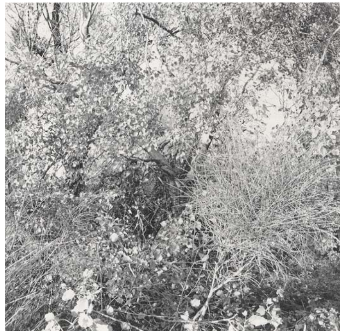
Supp. Fig. 2. A forest. This is mostly texture, with very few recognizable objects. Unlike perception of objects, the perception of texture is little affected by the location of fixation 23 . We suggest that one might define "texture" as what one can see without object recognition. Copyright © Ray K. Metzker, Courtesy Laurence Miller Gallery, New York.