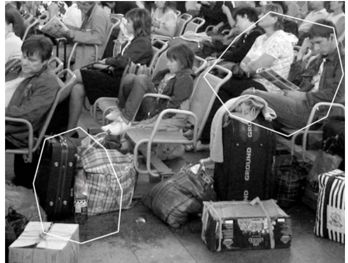
Supp. Fig. 1. The uncrowded neighborhoods (white polygons) of two objects: water bottle and magazine. You must fixate within its neighborhood to recognize the object. Fixating outside the uncrowded neighborhoods (e.g., on the little girl's face), you cannot recognize either of these objects. The neighborhood size (white polygon) depends on the local density of the clutter around the object and the similarity of the clutter to the object. The polygon is the measured threshold eccentricity for recognition in eight directions. These thresholds are subjective; the observer knew all along what the object was. Train station, Moscow, Russia, 2006.

In principle it would be similarly fruitless to combine over too small an area, getting only a fraction of the object. This matches some clinical descriptions of simultanagnosia: "It often appeared as if he were looking through a peephole which was too narrow to include the entire stimulus" 22 .