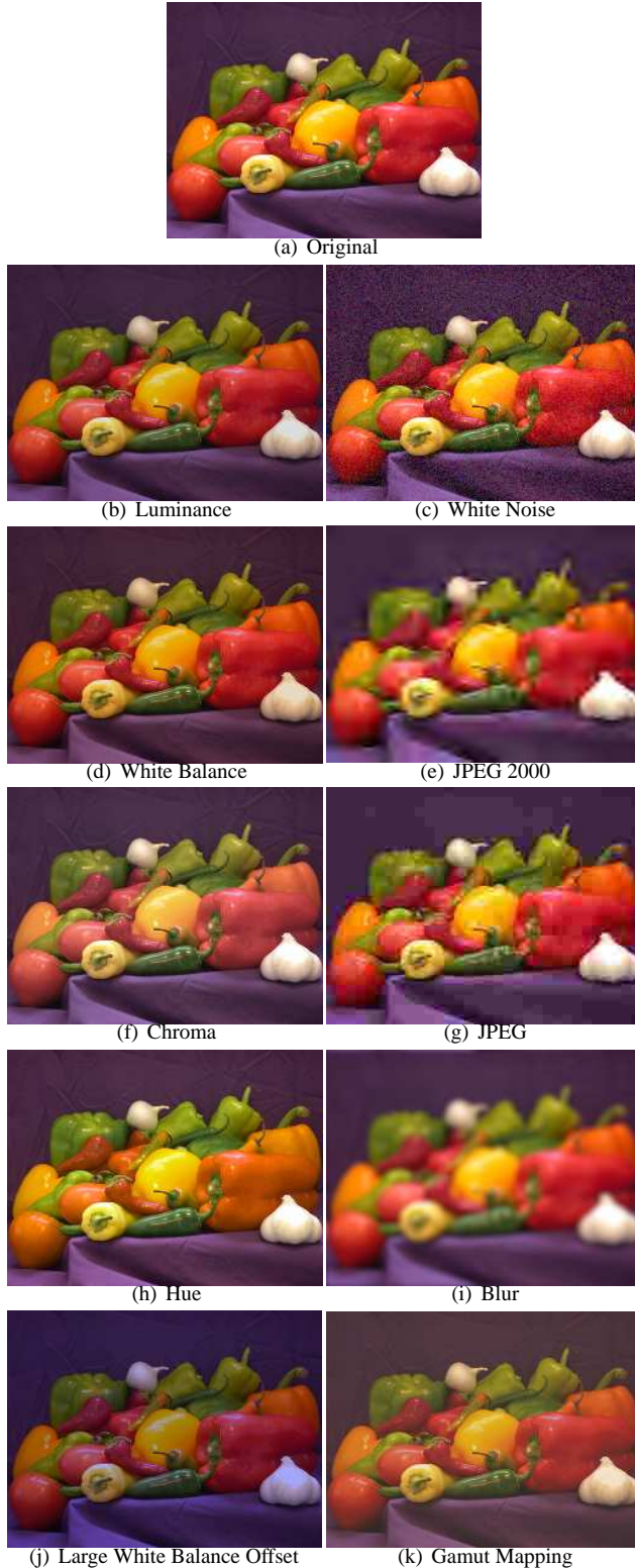
Fig. 2. Examples of distortions to the ‘Peppers’ image. The left column shows distortions that do not interfere with local image structures. The right column shows distortions that can interfere with local image structures. Distortion values for various metrics are shown in Table. 1.

( http://foulard.ece.cornell.edu/dmc27/vsnr/vsnr.html ), the distortion types are mainly of a spatial nature. As a result we used two specific types of color and spatio-chromatic distortions to demonstrate the performance of our method. First, we introduced global distortions along the adaptive basis directions as shown in the left column of Fig. 2. In particular, we simulated the following distortions: an incorrect white balance setting, where the red, green, and blue channels were each multiplied by a different scalar; an overall reduction in the brightness of the image; a slight decrease in the chroma of each color; and finally a shift in the hue of each pixel. Most of these distortions (except of the consistent hue shift) represent real world scenarios. The second set of distortions involved modifying the original image in directions that were not necessarily along the six adaptive basis directions. In particular, as shown in the right column of Fig. 2, the original image was subjected to corruption by white noise, blurring, JPEG/JPEG2000 compression. We also show a practical example of gamut mapping in which the sRGB gamut of the image was mapped to a printer’s smaller CMYK gamut.