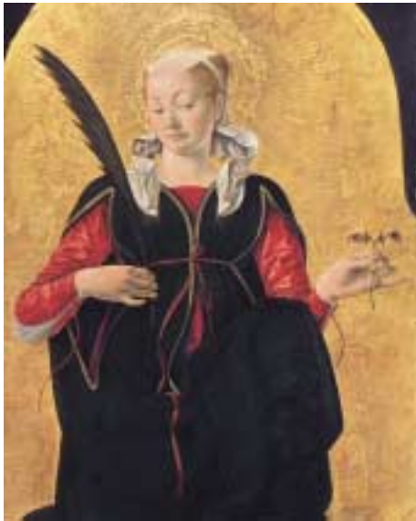
Fig. 2. St Lucy by Francesco del Cossa. A plant form with eyes held by the saint in one hand and a palm branch in the other refers to the medieval legend that St Lucy, patron saint of vision, sacrificed her sight for her Christian faith. The story goes that she rebuked a nobleman, who wished to marry her for the beauty of her eyes, by tearing them out saying, 'now let me live to God'.

The image of St Lucy is also useful in illustrating the two opposing theories that explain the phenomenon of binocular rivalry: one explanation is that visual information coming from one eye is suppressed early in the visual pathway ('eye-rivalry'; see St Lucy's left hand), whereas the alternative hypothesis regards the competition to be between neurons representing different stimulus representations ('pattern-rivalry'; see St Lucy's right hand).